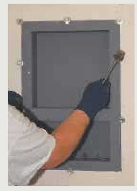
Install ProPanel® Lightweight Backer Board or Pro TEC™ Concrete Backer Board along with a FinPan PreFormed® Niche.

TI-ProBoard® offers a Commercial Floor Rating and can be cut to size and installed with standard tools. The ClearPath® Drain Plate comes with integrated drain assembly and offers flexibility in positioning of plumbing. The drain plate is also pre-pitched and serves as a template for proper sloping of the thin-bed that gets applied on top of the TI-ProBoard® base.