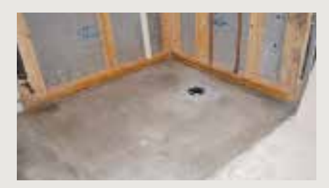
Allow to cure.