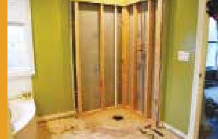
Determine shower area, remove existing subfloor.