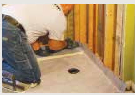
Install sheet membrane.