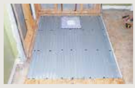
Install TI-ProBoard® perpendicular to joists.