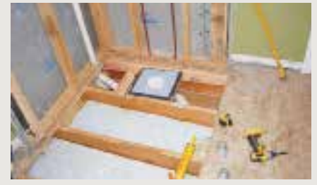
Install 2 x 4 blocking with top 1/4" below subfloor level. Connect drain stub to drain plate and secure.