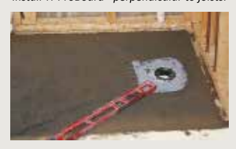
Float sloped ultra thin mud bed.